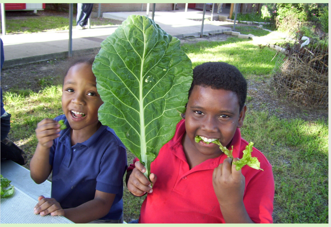
SATURDAY, FEBRUARY 29 9AM TO 12PM

Please feel free to join us this weekend as we collaborate with Mission Milby! if you have any questions, please feel free to reach out to us via email.